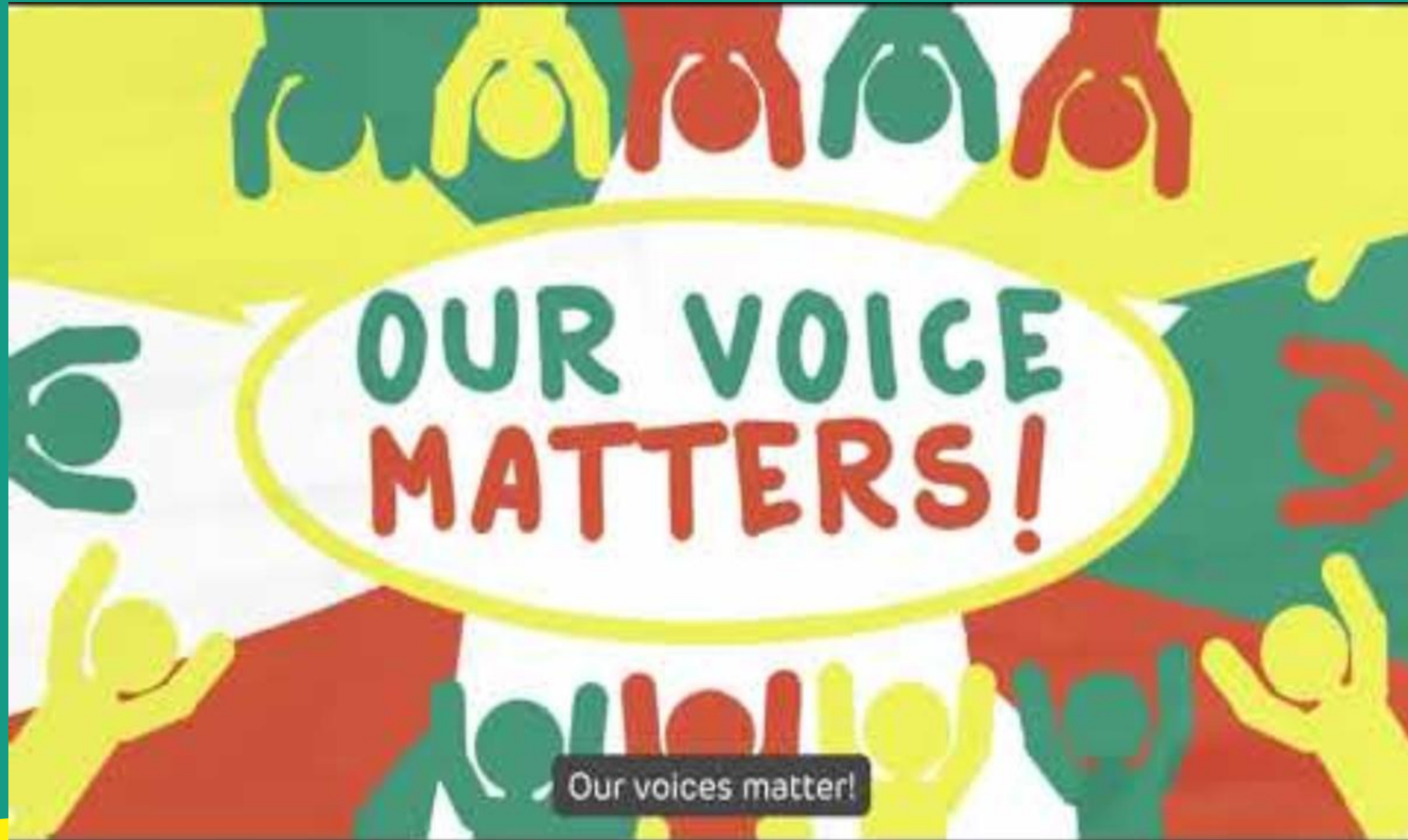
My Voice Matters | Children's Mental Health Week 2024 - YouTube